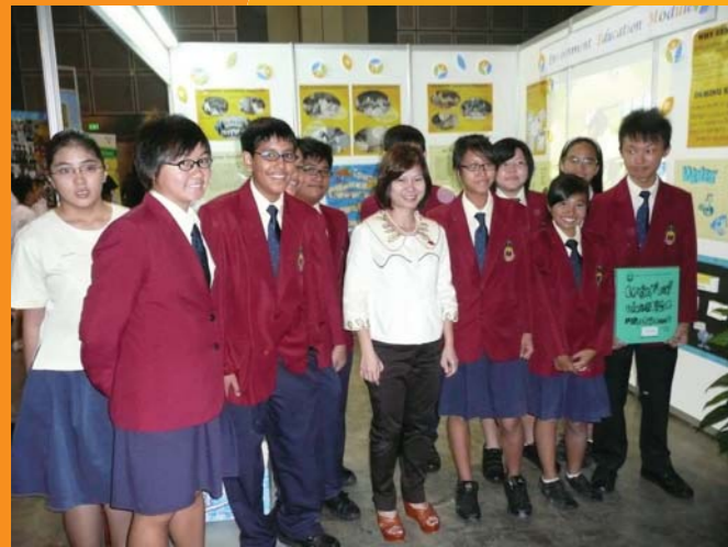
Shared EEM during Clean & Green Schools' Carnival 2007