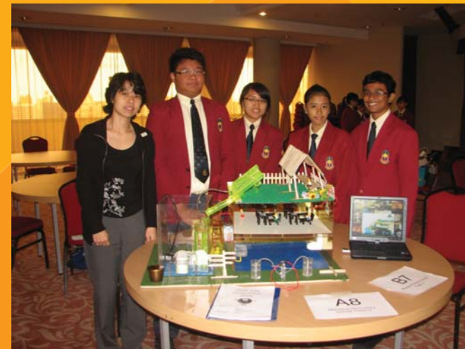
3 rd position in Solar City Competition 2008